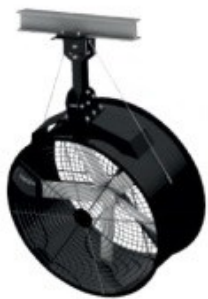
Up to 2 different diameters