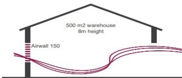
Get 15 air renewals per hour