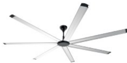
100W motor with 7 blades